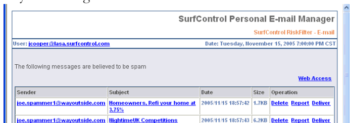
Figure 1 Personal E-mail Manager screen